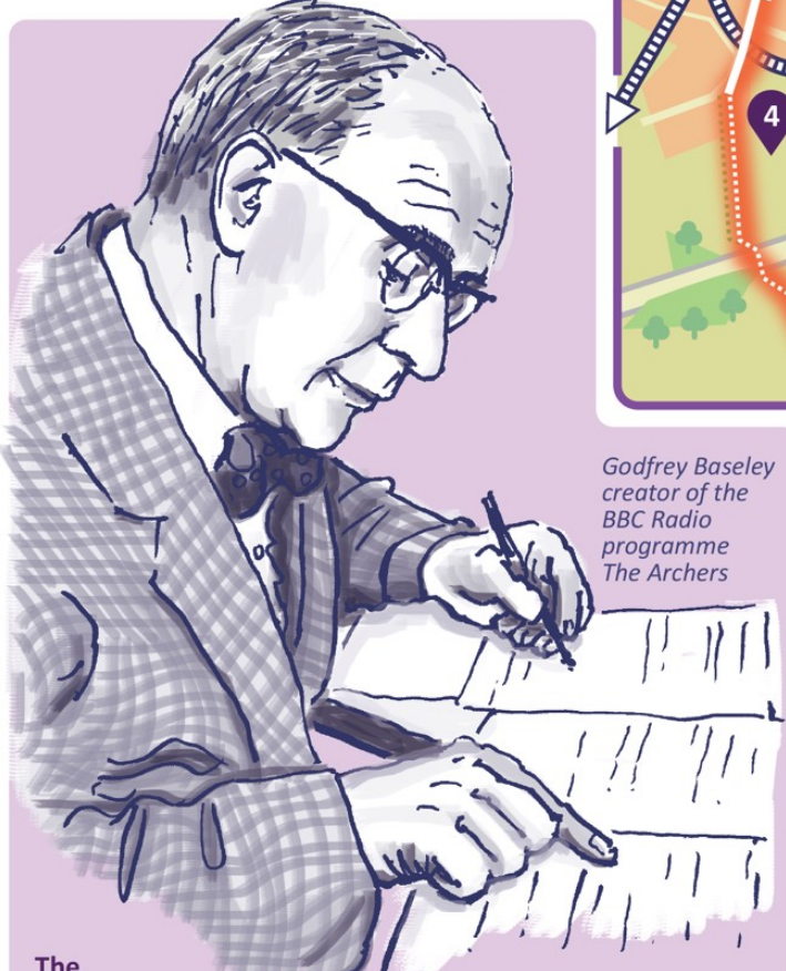
Godfrey Baseley creator of the BBC Radio programme The Archers

The Archers Born in Alvechurch in 1904 Godfrey Baseley was a British radio producer best known for creating "The Archers," a long-running radio drama series on BBC Radio 4. First aired in 1951, "The Archers" depicts rural