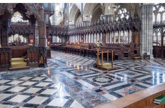
The new quire floor.