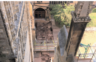
Excavation by AC Archaeology in the east Friend's Cloister Gallery.