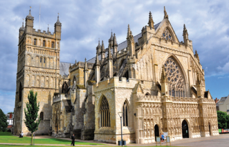
Exeter Cathedral West Front.