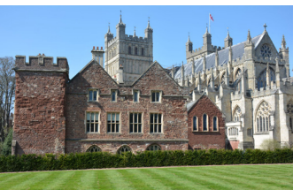
View of the Bishop's Palace from the east.