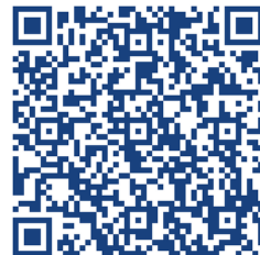
Barton Regatta Website