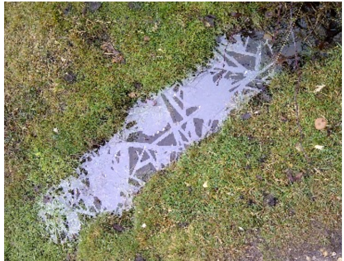
A mire in Winter filled with ice