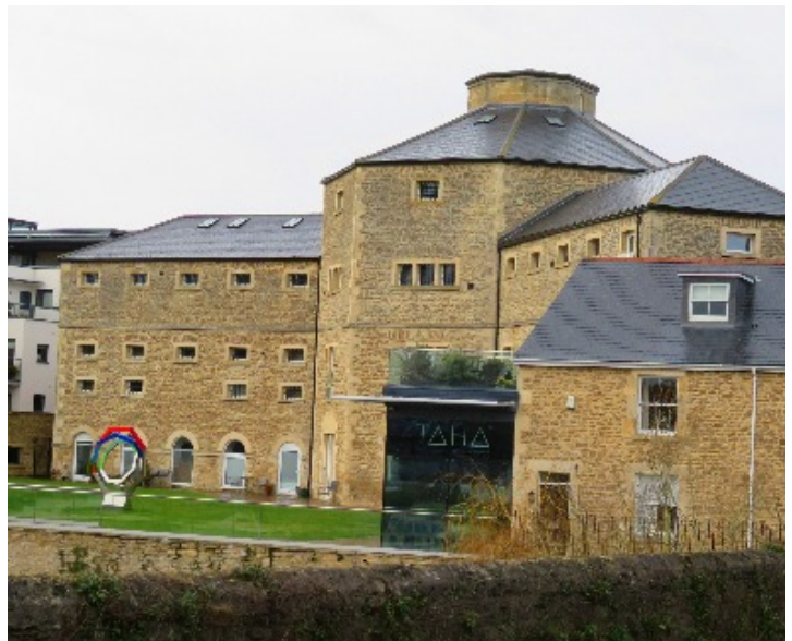
Abingdon's Former Jail, now luxury flats