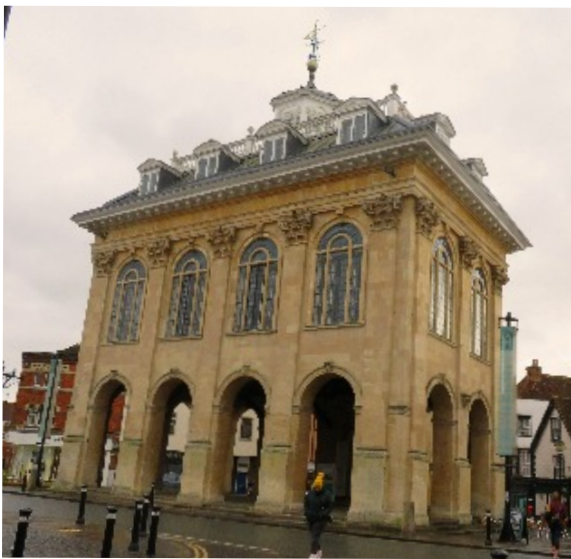
Abingdon County Hall was built as a Courthouse but is now home to a museum and contains the last MGB sports car made in Abingdon