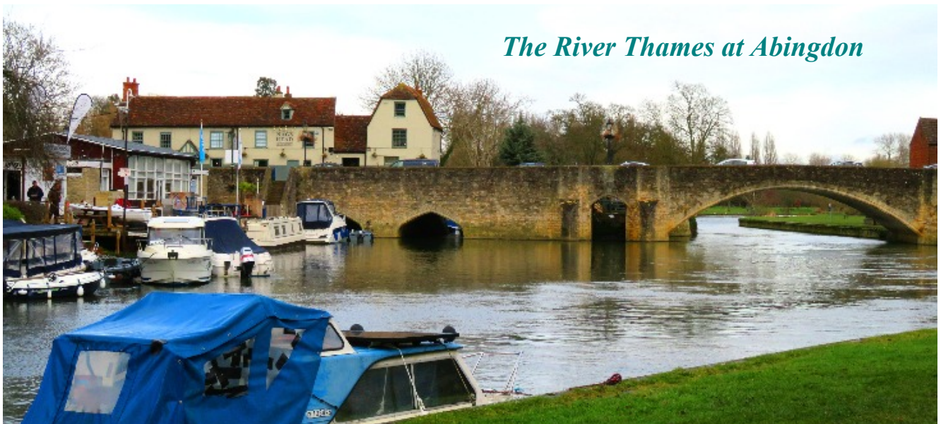
The River Thames at Abingdon