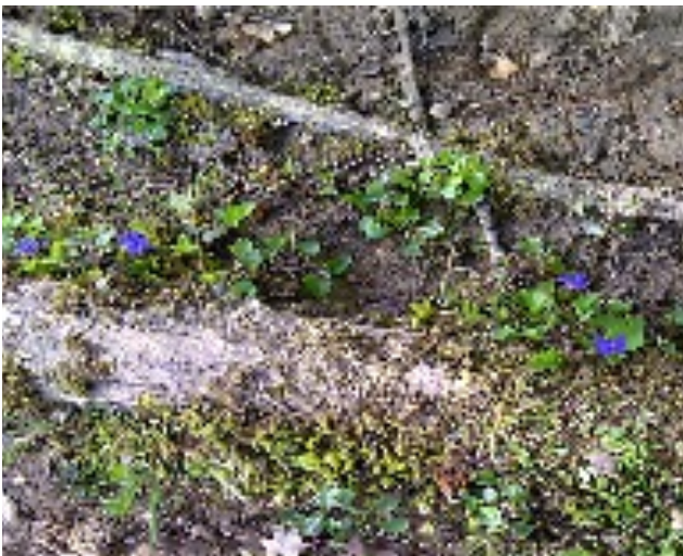
A mire in Spring filled with violets

Parts of the forest are used for commercial purposes and there are acres of pine trees which must provide enough telegraph poles for the whole country! There are also areas of peat bog which are very valuable as they can store enormous amounts of carbon and in the valleys are “mires” which get filled with plants such as sundew, bladderworts, aromatic bog myrtle, bog orchids and sedges.