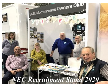
NEC Recruitment Stand 2020