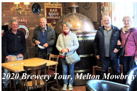
2020 Brewery Tour, Melton Mowbray