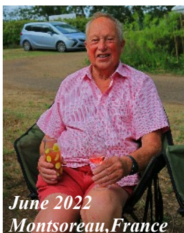
June 2022 Montsoreau, France