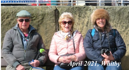
April 2021, Whitby