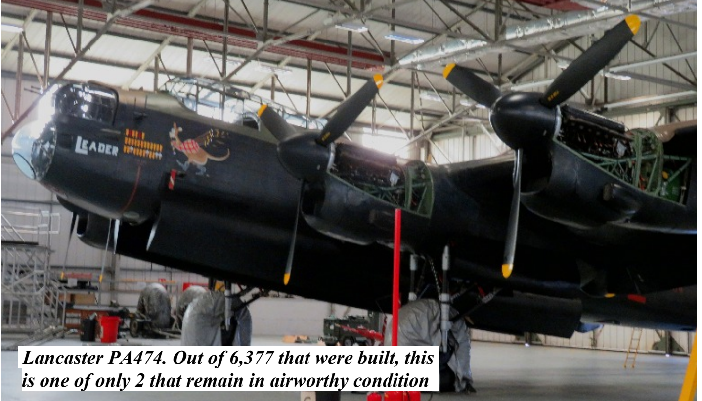
Lancaster PA474. Out of 6,377 that were built, this is one of only 2 that remain in airworthy condition

Also in the area (at RAF Coningsby) is The Battle of Britain Memorial Flight. Unfortunately the No. 56 does not go there, but with a change at Horncastle it was possible to get as far as Coningsby Village. The 'Flight' presently consists of twelve aircraft:- 6 Spitfires, 2 Hurricanes, Lancaster, Dakota, and 2 Chipmunks. They are operated by the Royal Air Force and have been based at RAF Coningsby since 1976. Those members who had cars visited and we put it on our list to get there next time.