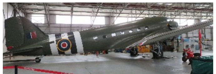
Douglas Dakota ZA947 Used in WW2 to fly wounded soldiers from a temporary airstrip on the beach in Normandy, France